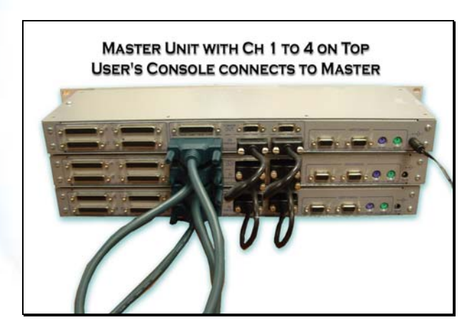
FIGURE 3 Stacking of MC4-H2 Units

In order to connect two or more units to expand the number of PC's that you control, you need to order a Daisy-Chain Cable Set. Connect the OUT of the Slave #1 to the IN of the Master. If you have a 2<sup>nd</sup> slave connect the OUT of it to the IN of Slave #1. The Power Supply connected to the master unit will power up the Slave Units through the expansion port. However there is no damage if you connect supplies to the slaves and in fact it is recommended when you have 3 units.